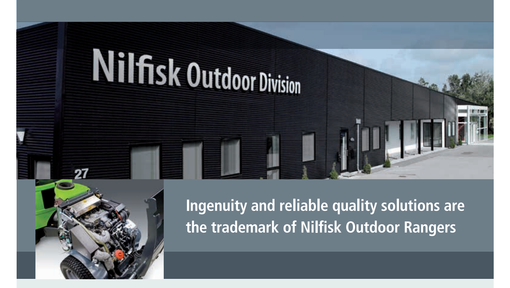
Efficient and professional assembly at Nilfisk Outdoor