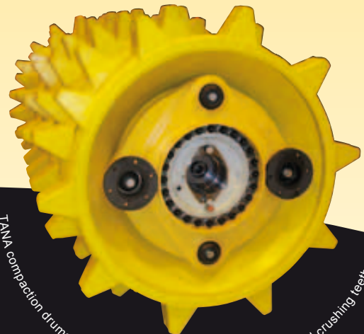
TANA compaction drums – two full width drums with forged solid steel crushing teeth.

Weights and measurements are given within normal tolerances. Manufacturer reserves the right to alter the above as necessary. Some features shown may be optional and not standard.