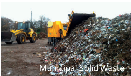
Municipal Solid Waste