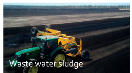
Waste water sludge