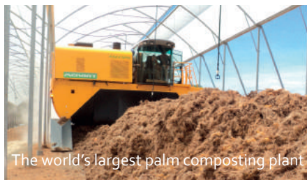
The world's largest palm composting plant