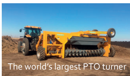
The world's largest PTO turner