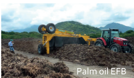
Palm oil EFB