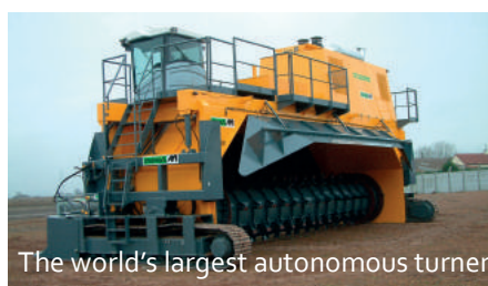
The world's largest autonomous turner