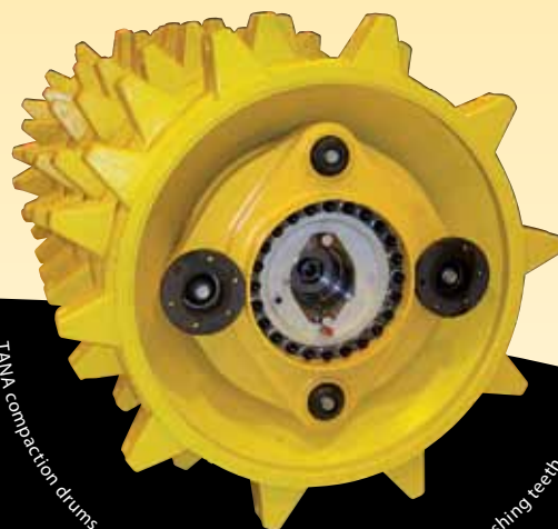
TANA compaction drums – two full width drums with forged solid steel crushing teeth.

Weights and measurements are given within normal tolerances. Manufacturer reserves the right to alter the above as necessary. Some features shown may be optional and not standard.